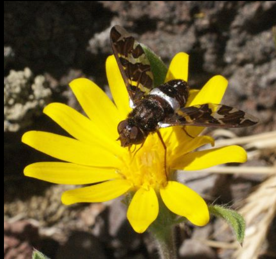
Flower-loving Fly on Oregon Sunshine