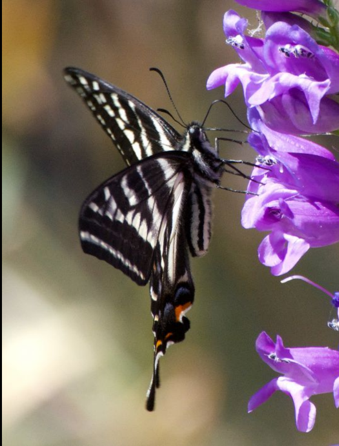
Pale Tiger Swallowtail on Penstemon