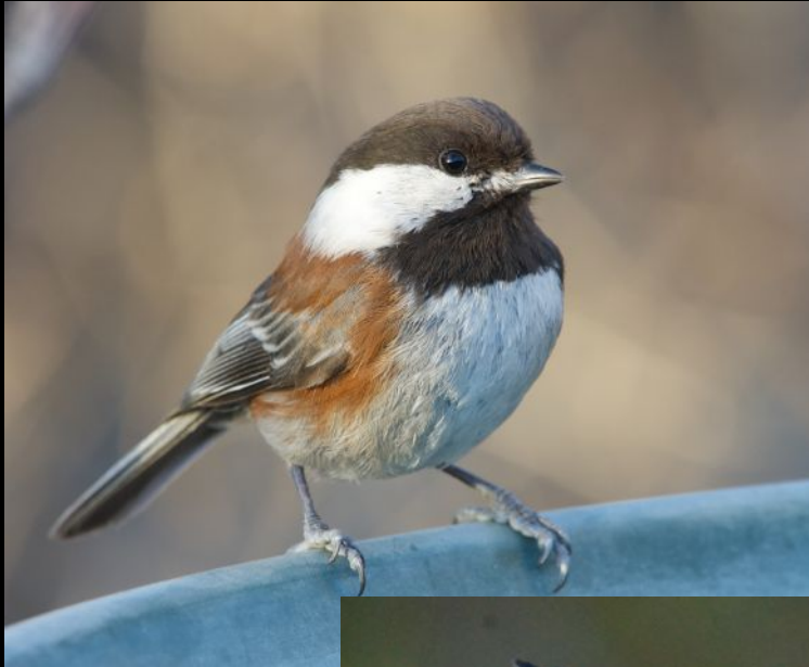
Chestnut- backed Chickadee