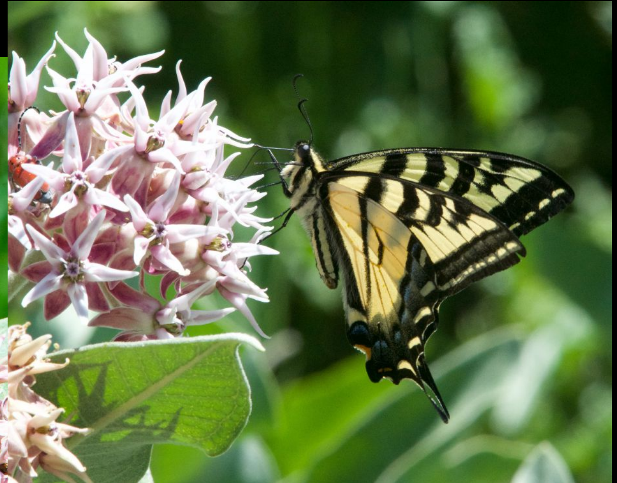
Western Tiger Swallowtail