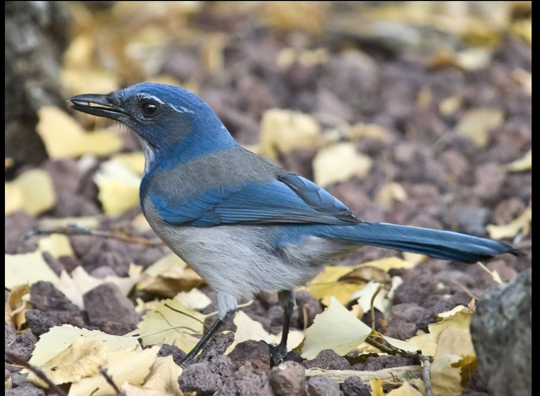
Western Scrub Jay