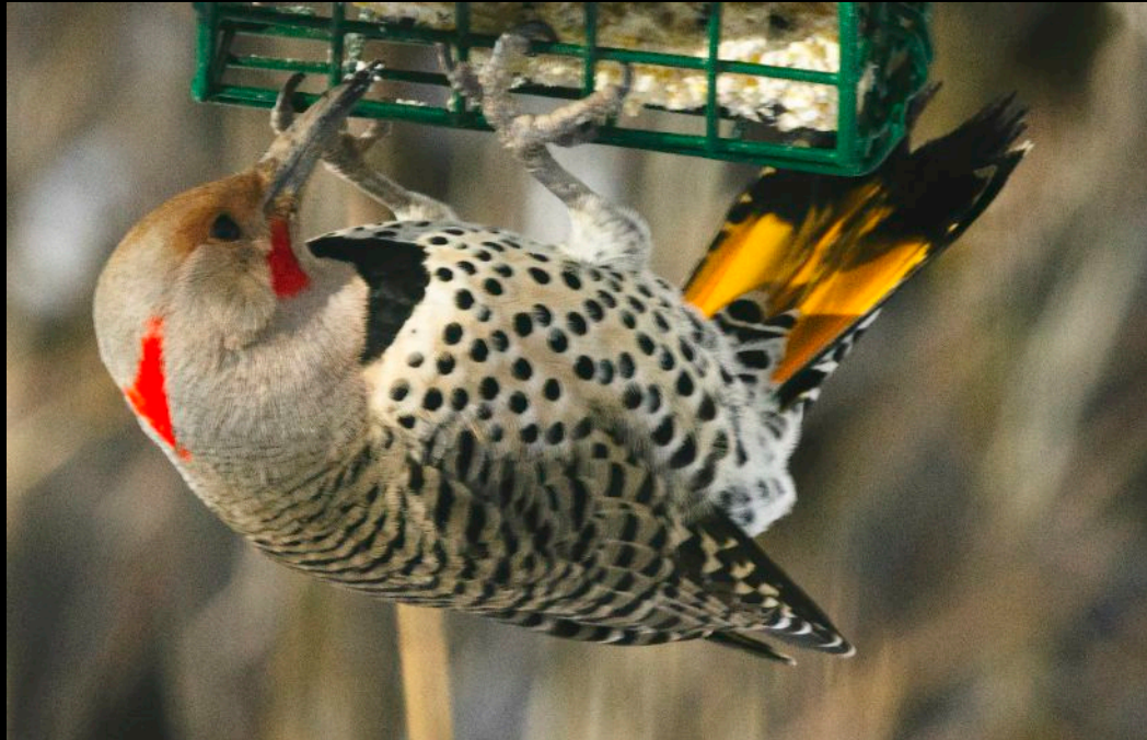
Hybrid Northern and Yellow-shafted Flicker