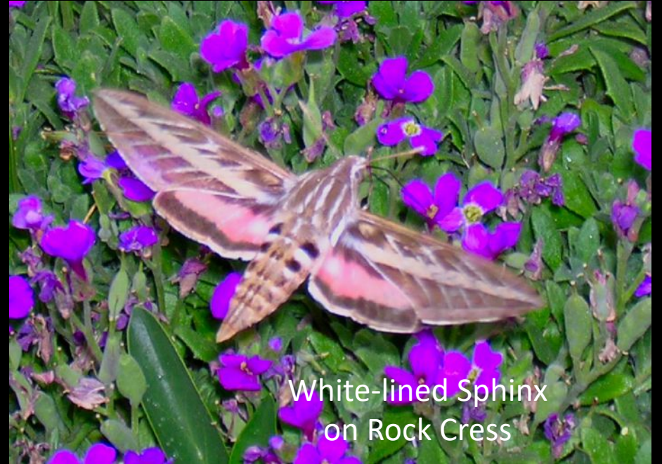
White-lined Sphinx on Rock Cress